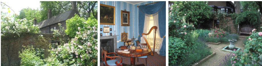
The Geffrye Herb Garden and Regency Room

You can become a Victorian, Georgian or Stuart Patron by making yearly contributions of £2,500, £5,000, and £10,000 or over respectively. Your membership is tailored to suit your interests and passions, so that you can become part of the life of the Geffrye.